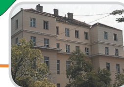
Institutes of Pathological Anatomy, Pathological Physiology, Microbiology and Pharmacology, Clinical Pharmacology and Toxicology