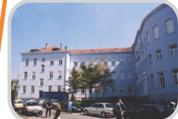
Clinic for Alergology and Immunology, Hematology and Gastroenterology