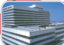
Clinical Center - Diagnostic Center and Outpatient Clinic