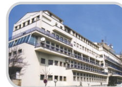
University Children's Hospital