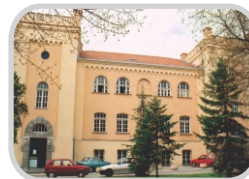
School of Public Health