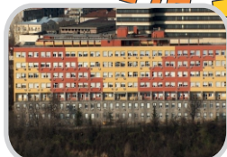
Clinic for Gynecology and Obstetrics