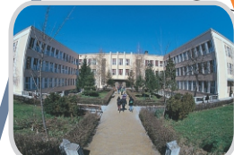
Institutes of Physiology, Histology, Biology, Chemistry, Biophysic and Epidemiology