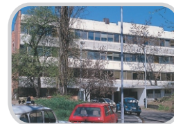
Institute of Forensic Medicine