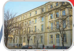
Clinic for Cardiovascular Diseases