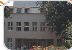
Institute of Social Medicine