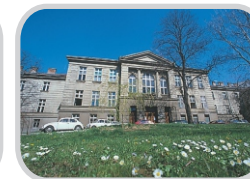
Institute of Anatomy