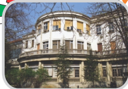
Clinic for Pulmonary Diseases