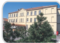
Clinic for Ophthalmology