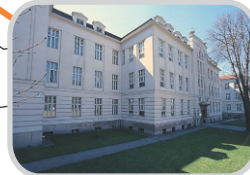
Clinic for Endocrinology, Diabetes and Metabolic Diseases